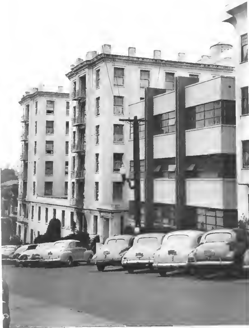
Ruth Lucie Stern Research Laboratory